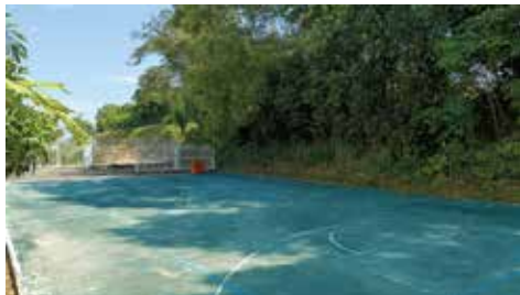
Outdoor Multipurpose Court